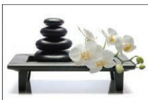
Metropolitan Institute of Interior Design