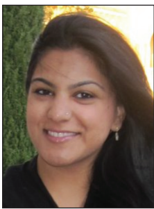
Batool F. Rizvi D.D.S., P.C.